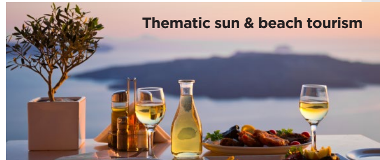
Thematic sun & beach tourism