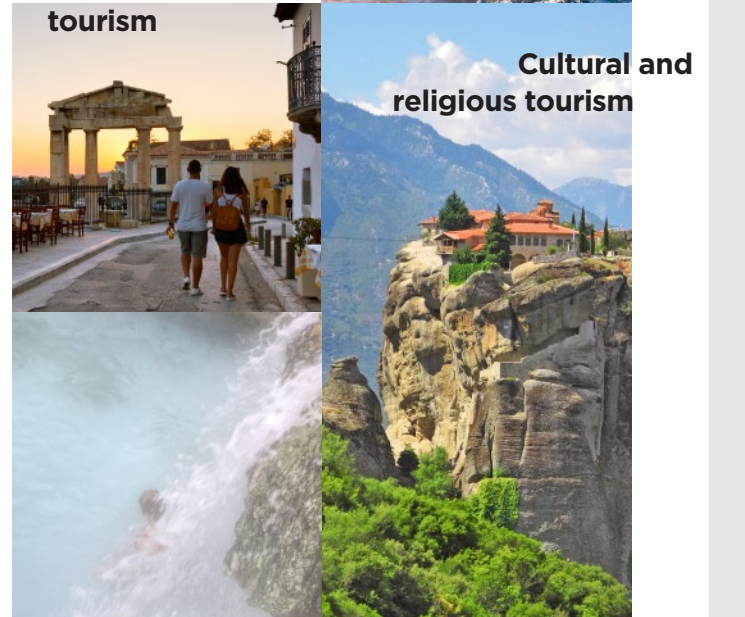
City Break tourism