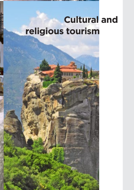
Cultural and religious tourism