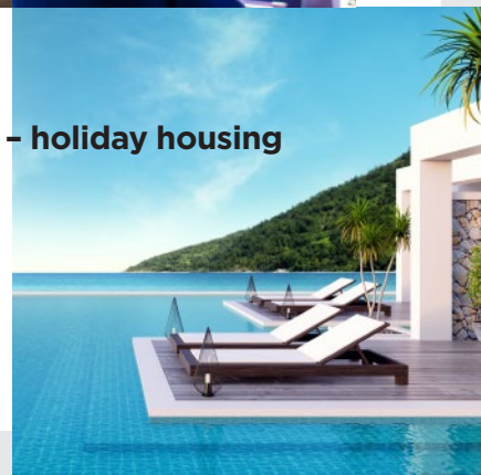
Integrated resorts – holiday housing