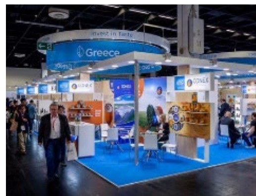
Greek Pavilion at Anuga.